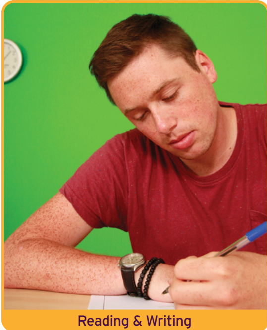
Reading & Writing

ISE III is an English language exam for learners of English who are at level C1 of the Common European Framework of Reference. You take ISE III in two parts – Reading & Writing and Speaking & Listening.